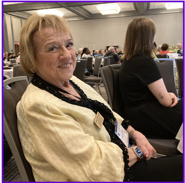
NAP Convention NAPEF Event. Atlanta, GA